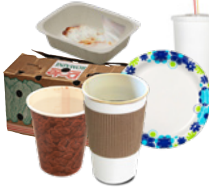
Coated Paper Cups/Plates, To Go Containers, Wax-lined Food Cardboard Boxes