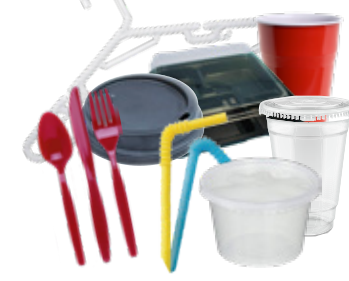
Plastic Cups & Lids, Utensils, Straws, Clam Shells, Deli Containers & Hangers (Including "compostable" plastic serveware)