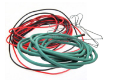
Hoses, Cords & Wire (Electrical wires are e-waste. Refer to Hazardous Waste Disposal Information)