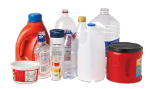
Empty Plastic Bottles, Rigid Plastic Containers (Lids should be left on or placed in trash)

Have a question about where you can recycle an item? Check out www.recyclewhere.org or call Stopwaste's Recycle Hotline at 1-877-STOPWASTE.