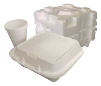
Polystyrene Foam & Packaging